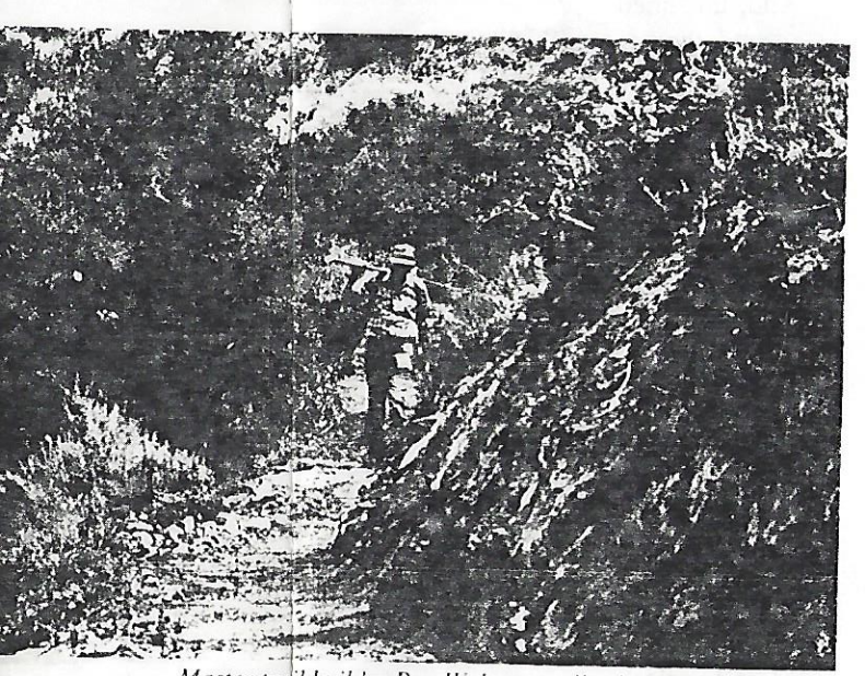
Master trail builder Ron Webster walks the trail he designed

A bit more than a mile's descent from the top brings you to a water tank, and two miles along to an apiary. The Foothill Freeway comes into view, the road turns to asphalt, and you'll travel the frontage road one-half mile to La Tuna Canyon Road. Here you'll head west (use caution when walking on the road shoulder) 1.3 miles back to the trailhead.